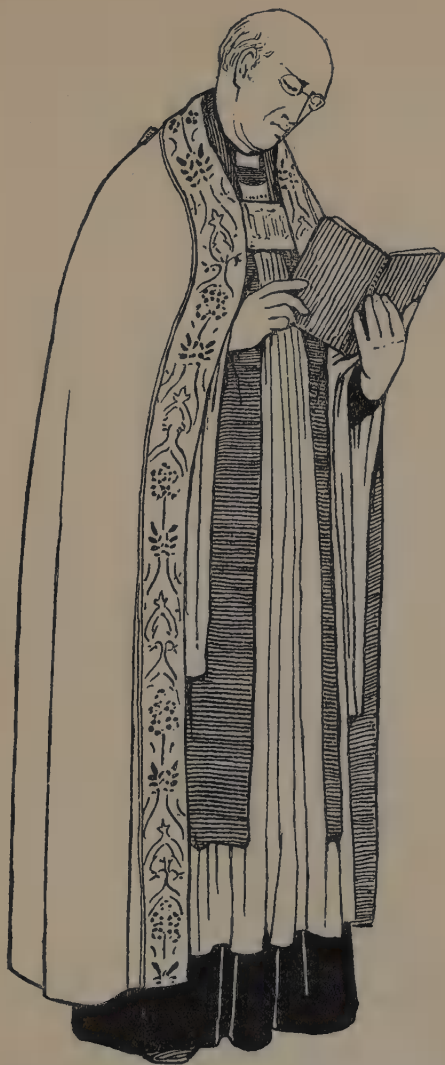
PRIEST IN CASSOCK, SURPLICE, SCARF, AND COPE.